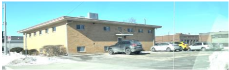
Back (27 th St)

4- Parks & Schmit Orthodontics 2727 1 st Ave SE 52402