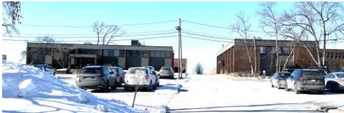
Backs (2 nd Ave)

5- Brady Preston Brown Law Firm 2735 1 st Ave SE 52402