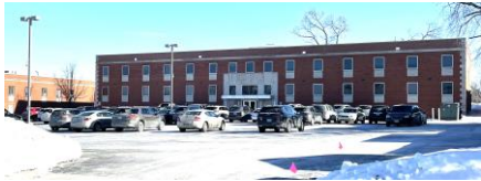
Access in Back (A Ave)

2- Corporate Center East/Frese Enterprises 2750 1 st Ave NE 52402 Right side of A Ave