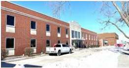
Front (1 st Ave)

1- 2720 Office Building 2720 1 st Ave NE 52402 Right side of A Ave