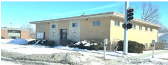
Front (1 st Ave)

3- DentalCare Associates, PC 2701 1 st Ave SE 52402 (corner of 1 st Ave & 27 th St)