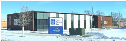
Front (1 st Ave)

6- First Interstate Bank 2739 1 st Ave SE 52402