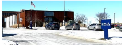
Back (2 nd Ave)