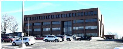
Access in Back (A Ave)