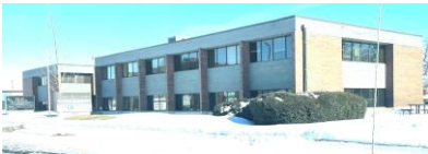
Fronts (1 st Ave)

4- Parks & Schmit Orthodontics 2727 1 st Ave SE 52402