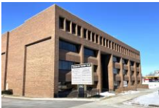
Front (1 st Ave)

2- Corporate Center East/Frese Enterprises 2750 1 st Ave NE 52402 Right side of A Ave